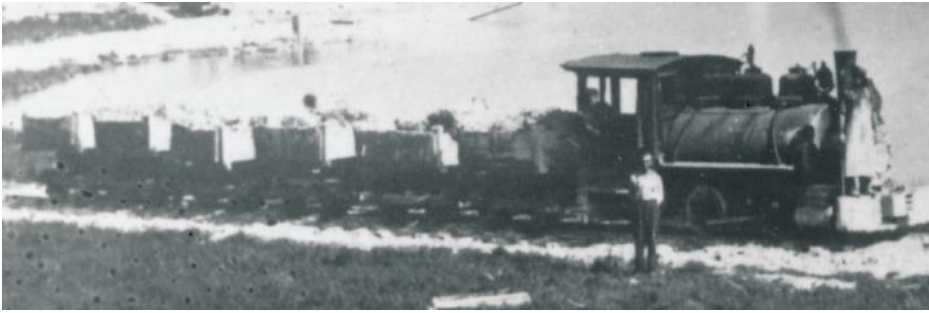
Portland cement which was bagged and shipped out on the railway..

By 1903 the laboratory building also served as the Blue Lake Post Office