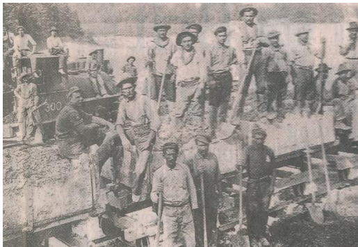
Residences were built for the workers who came from as far away as Italy, Armenia, Russia and Bulgaria

In 1904 the Grand Valley Electric Railway which ran from Brantford to Galt ran a spur line about 2 miles long to join up with the main line of the Grand Trunk Railway, which connected by a spur to the plant.